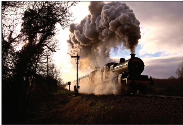
A dramatic departure from Bishops Lydeard in wonderful low light conditions, only possible in December, as 7F No. 88 takes a train of children to see Santa on 17th December 2006.