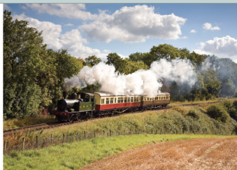
Opposite page: GWR 0-4-2T No. 1450 heads a two coach auto train past Narrvis Bridge near Crowcombe on 4th October 2007.