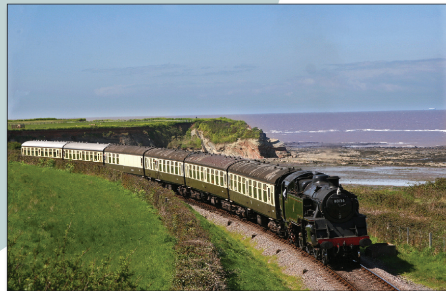
The Bristol Channel forms the backdrop to this shot of BR Standard tank No. 80136 rounding the curve on the cliff tops at Doniford on 1st May 2006.