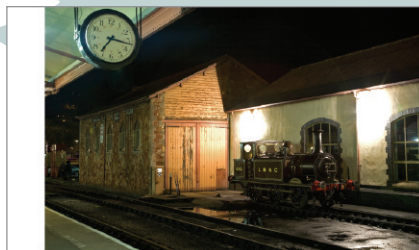
A night scene at Minehead shed on 27th October 2007 sees No. 62 Marfella resting after its day's work on the line between Minehead, Dunster and Blue Anchor.