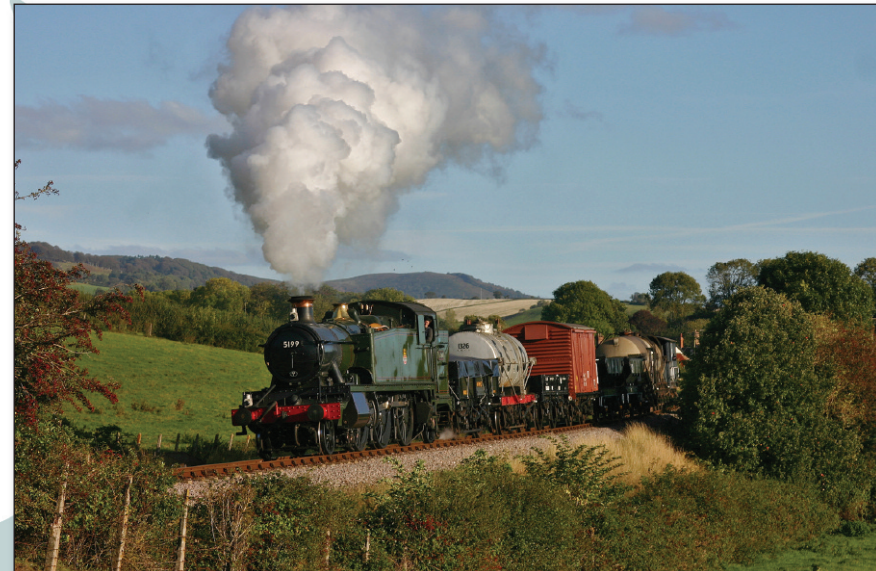
On a photo charter No. 5199 is worked downhill at Sampford Brett with a goods train on 4th October 2004.